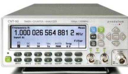
Figure 3: Input parameter setting menu shown with measured result.