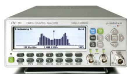
Figure 6: The same result as in Figure 5, now displayed as a histogram.